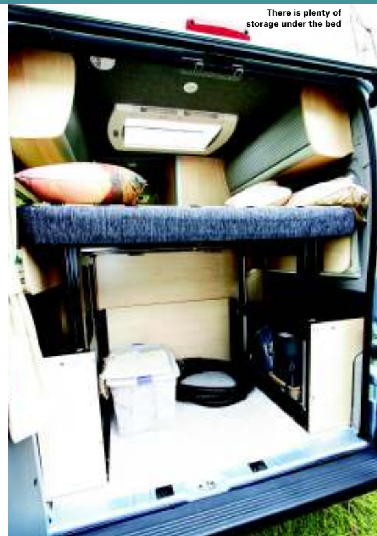
There is plenty of storage under the bed