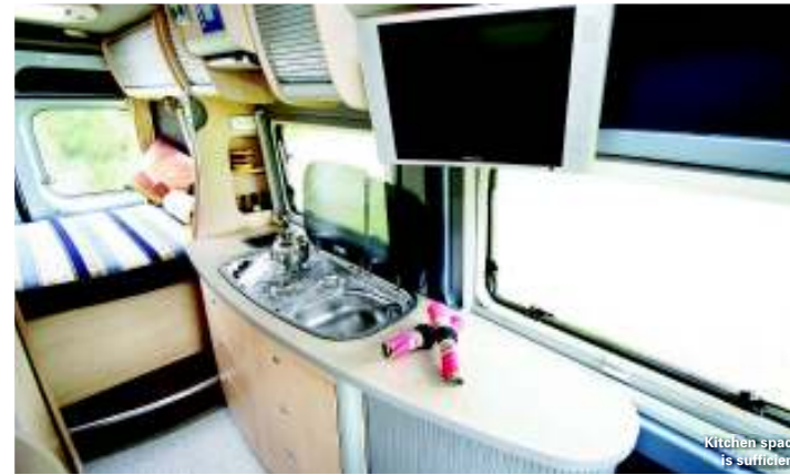
Kitchen space is sufficient

The rig's classy looks and innovative design features continue in the Torino's interior.