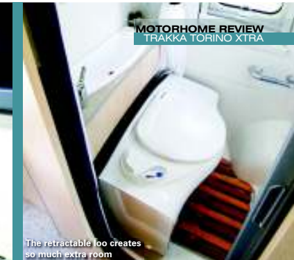
The retractable too creates so much extra room