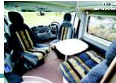
The cab seats swivel