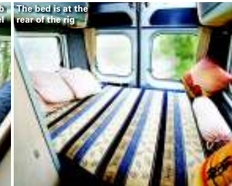
The bed is at the rear of the rig