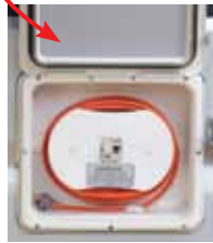
Tidy 240V lead locker