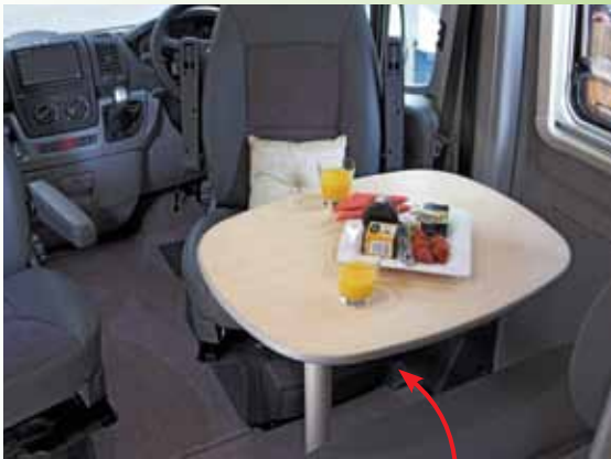
Relaxing front lounge and dining