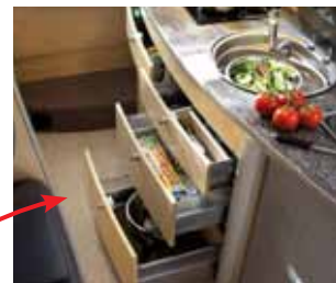
Plenty of kitchen storage