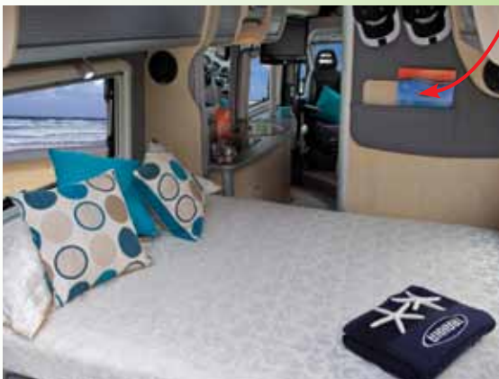
Roomy rear double bed