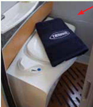
SMB motorized toilet slides away