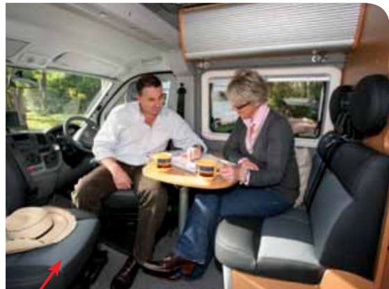
Well designed living area