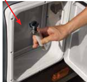
Handy external shower