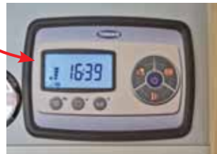
Simple electronic monitoring