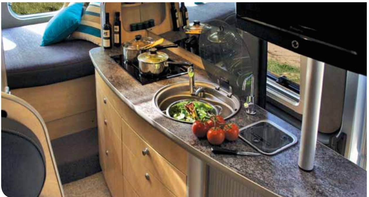
Ergonomically designed kitchen with alternative REMOTE diesel stove

Relaxing Front Lounge Behind the front cab seats are two additional ADR approved traveling seats that create the comfortable lounge/dining area when the cab seats are rotated – the Torino Xtra has been so skillfully designed you can sit uninterrupted on the lounge while others use the kitchen, the bathroom or the bedroom. Slot in the clever multi-position table and there's room for friends to join you for dinner.