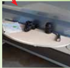
Handy outside table