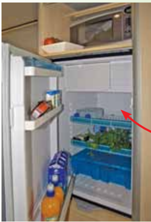
Large fridge and microwave oven