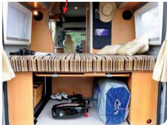
Motorized bed raises to stow even bigger cargo